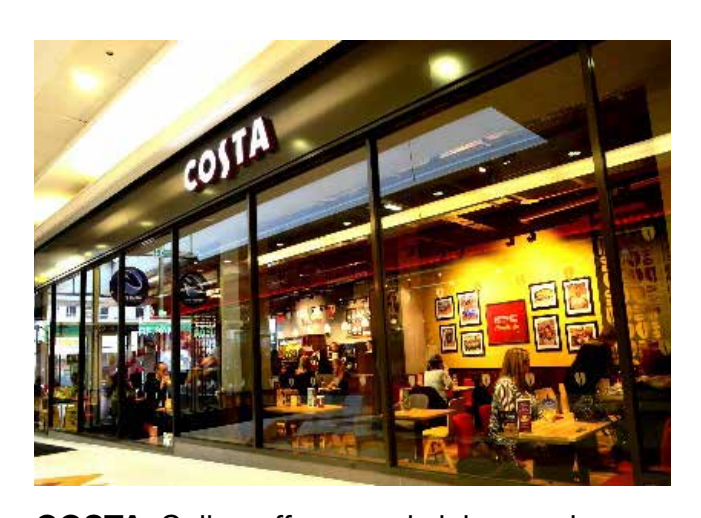
COSTA : Sells coffee, sandwiches and muffins. West Mall