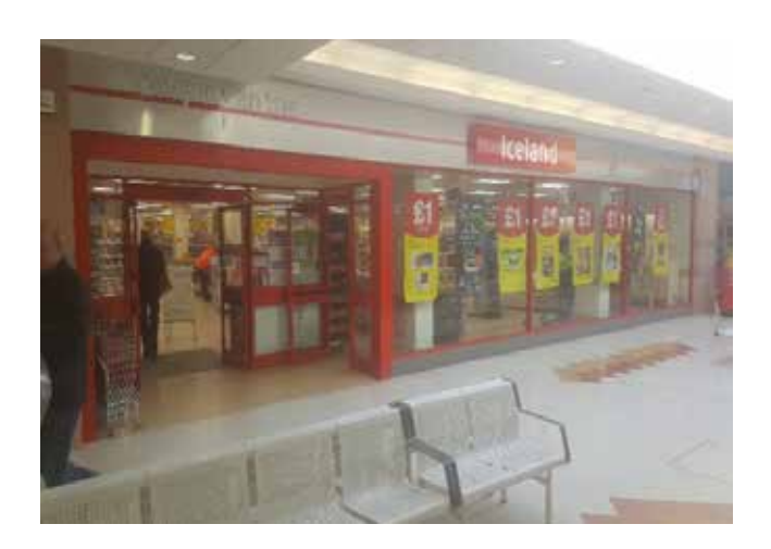
Iceland: Excellent value Food Shopping.