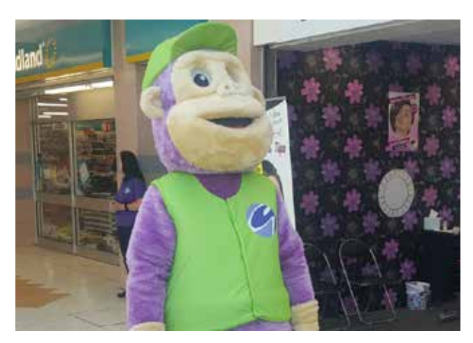
Gary the Grays Gorilla