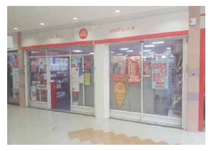
Post office: found along the south mall

To help you, or the person you are with, navigate around the shops here are some pictures of four of our largest stores and attractions in the centre, that you can use as signposts.