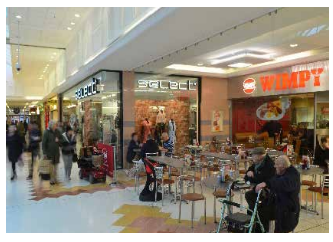
WIMPY: Tasty meals at your table