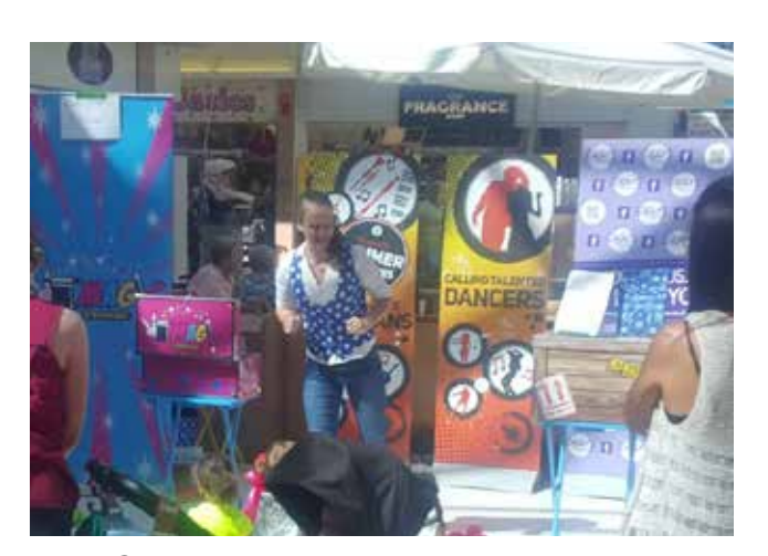
Kids Club activites