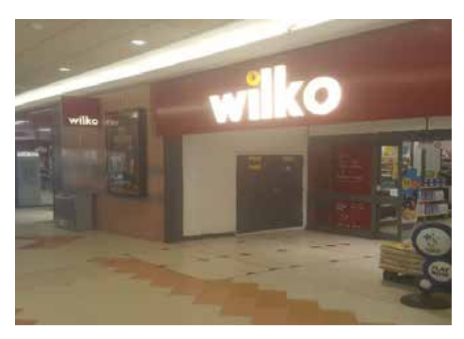
Wilko: For all your household / DIY / Pets / Toiletries / Sesonal and much more!