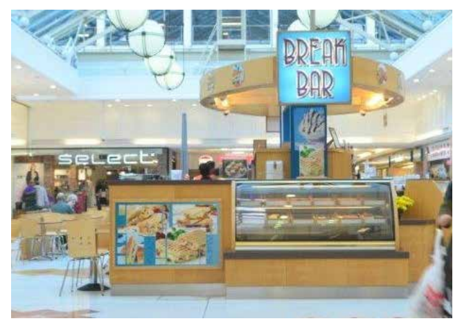
Grays Shopping Centre's Break Bar : Centre Square

You can eat at Grays Shopping Centre; we have identified a number of quieter eateries and places that you can also sit to eat packed lunches.